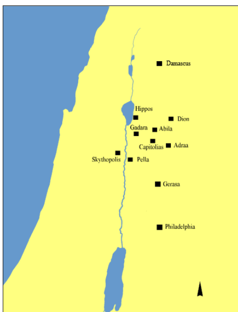
Figure (1) map of Decapolis. (After: Riedl, 2003).