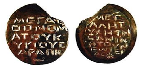
Figure 4) a jasper gem, collections of the Cabinet des Médailles de Paris (After: Veymier, 2014).

Henri Seyrig before entering the collections of the Cabinet des Médailles de Paris, which associates the goddess called 'Neotera' with the Egyptian god Serapis. On one side of the gem, Serapis is mentioned as "Great is the name of Lord Serapis", accompanied by a lunar crescent, while the other bears the inscription "Great is the fortune of Neotera, the invincible", followed by a star. However, the real identity of the goddess remains unknown [39,40]. In later testimony, Athanasius of Alexandria railed against the pagans, mentioning [41]: "Isis, Kore, and Neotera among the Egyptians, and so with Aphrodite among other people". Neotera was frequently associated with members of the Isiac family. Hence, the inscription from Gerasa was not an isolated example. Furthermore, the epithet "Neotera" appeared on some coins of Cleopatra VII, especially in some coins minted in 36 BC in Phoenicia, Cyrenaica, and Chalcis, as well as an inscription from Cyprus [42]. The epithet "Neotera" was also found in Egypt related to Cleopatra VII; a papyrus from Herakleopolis dated 35 BC showed Cleopatra VII as "Neotera" [43].