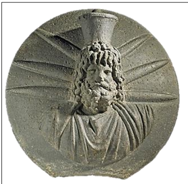
Figure (2) a basalt disc of Serapis-Helios, the British Museum, Inv., No., 1929, 0419.1. (After: Tallet, 2020)

On the other hand, the association of Zeus and Serapis was still comparatively uncommon during the Hellenistic period, but this changed in Roman times [26]. Alexandrian bronze drachms from the time of Neron, in which Zeus and Serapis were regarded as the protective gods of the emperor, showed a pictorial amalgamation of the two gods. This relationship had been firmly established since the reign of Vespasian [29]. Under the rule of the emperor Trajan and even more during the reign of Hadrian, the close association of Zeus Helios Serapis took on a definitive form with the appearance of the god "Zeus Helios Megas Serapis". The cult of this deity is well-attested in Alexandria, Canopus, and quickly spread even throughout the Eastern Desert, including Mons Claudianus and Mons Porphyrites [30,31]. Nevertheless, the cult was not exclusive to the roads of the Eastern Desert