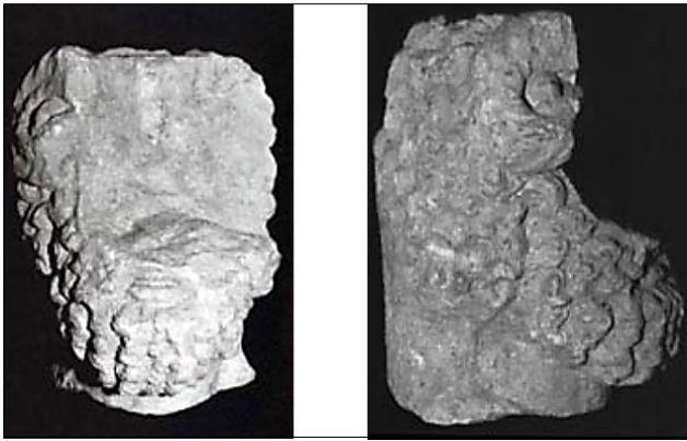
Figure (6) a limestone head of Serapis-Zeus-Ammon, Gerasa, DOAJ, Inv. No. Magazin im Artemision, 1990, H 9.7 cm (After: Weber, 2002).

Moreover, two objects that associate the god Serapis with Ammon come from Gerasa. The first object is a small limestone head; found in a pottery storeroom, fig. (6); despite its bad condition, the subject can be easily identified as Serapis-Zeus-Ammon. The head had a relatively straight break in the base of the neck, except for the chin area to the lower lip. Unfortunately, the entire face, including the skullcap, was destroyed [10,52]. However, traces of hair design can still be seen on the beard and the back of the head; the individual curls are clearly separated, and the strands are divided by incised lines. The upper lip was covered by a mustache, and the beard was split into two strands. While the beard shape is characteristic of Serapis depictions, the twisted ram's horn reproduced in the temple area represented an iconographic reference to the god Ammon. The presence of a round recess at the top of the head suggests that it was likely used to attach a kalathos made of a different material, commonly observed in Serapis depictions. The dating of the head remains uncertain, but researchers believe the piece dates from the 2 nd century AD to the early 3 rd century AD, a time in which many repetitions of the classic Ammon portrait can be dated [52].