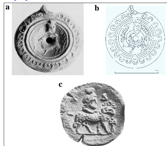
Figure (7) a , a terracotta lamp of Serapis-Ammon, Gerasa, Jordan Arc. Museum, Amman (formerly Jerusalem, Rockefeller Arc. Museum 38.1769) (After: Rosenthal-Heginbottom, 1981), b , a drawing by Abd El-Halim, c , Alexandrian coin of Antoninus Pius (After: Hornbostel, 1973).