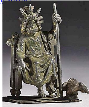
Figure (3) a bronze figurine of Zeus Helios Megas Serapis, British Museum, Inv. No. GRA 1772, 0302.172 (After: Tallet, 2020).

The identity of Neotera "the younger", mentioned in the inscription, remains a matter of speculation. Nonetheless, the epithet "Neotera" seems associated with several deities such as Isis, Kore/Persephone, Aphrodite-Hathor, and Nephthys [11,36-38]. A stela dated to 98 AD was discovered in the enclosure of the great temple of Dendera, dedicated to the goddess Aphrodite-Hathor with the epithet "Neotera Thea" [39]. Additionally, a papyrus from Oxyrhynchus XII, 1449, dated to 213-217 AD, mentioned at least one place of worship for Neotera and described votive offerings that included the portrait of the imperial family and some representations of the goddess. There is also a small gem made of green and red-brown jasper, fig. (4), formerly owned by